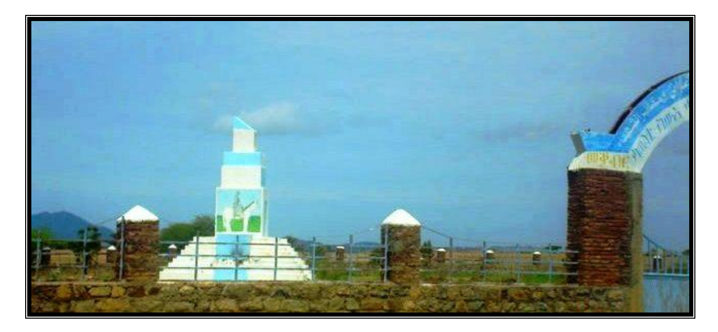
The Eritrean Opposition (political, non-violent), Resistance (use of force) and Revolution went through Four main historical phases or stages:

Burial place : Martyr Awate's original burial place was kept secret (except to very few individuals) and it was in the east of Hadamdami and west of Gash where special and clear signals were marked to identify the burial place of the martyr Awate. In September 1994, the remains of martyr Hamid Awate were buried in the historic city of Haikota.