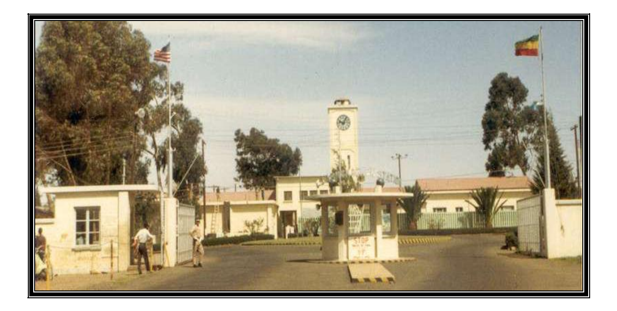
Kagnew Station – Asmara (main gate)

"The Cold War listening station, Kagnew Station, was located nearly on the equator and at an altitude of 7,300 feet (2,200 m) above sea level. Its altitude and close proximity to the equator made Kagnew Station an ideal site for the Cold War listening station's dishes and the 2,500-acre (10 km<sup>2</sup>) antenna farm. In all Kagnew sprawled over 3,400 acres (14 km<sup>2</sup>) containing eight fenced or walled tracts. Kagnew Station became home for over 5,000 American citizens at a time during its peak years of operation during the 1960s." ( Source: Kagnew Sation - From Wikipedia, the free encyclopedia