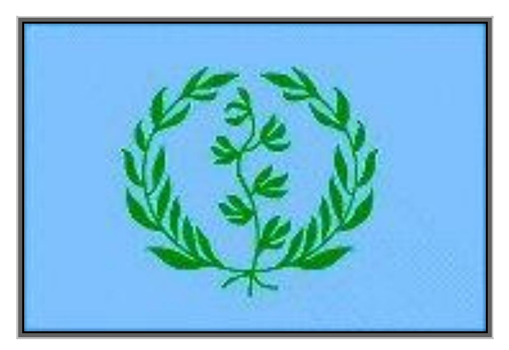
What are the reasons that led to the declaration of "Armed Struggle" by martyr and hero Hamid Idris Awate?

Within 10 years, Haile Selassie fundamentally transformed the relationship between Eritrea and Ethiopia and forcibly annexed Eritrea on 15 November 1962. Ethiopia's unilateral decision to annex Eritrea abrogated the UN provisions, which stated that only the UN General Assembly could amend the federal relationship. Ethiopia justified the annexation of Eritrea by referring to the Eritrean General Assembly's majority vote for the union in 1962.